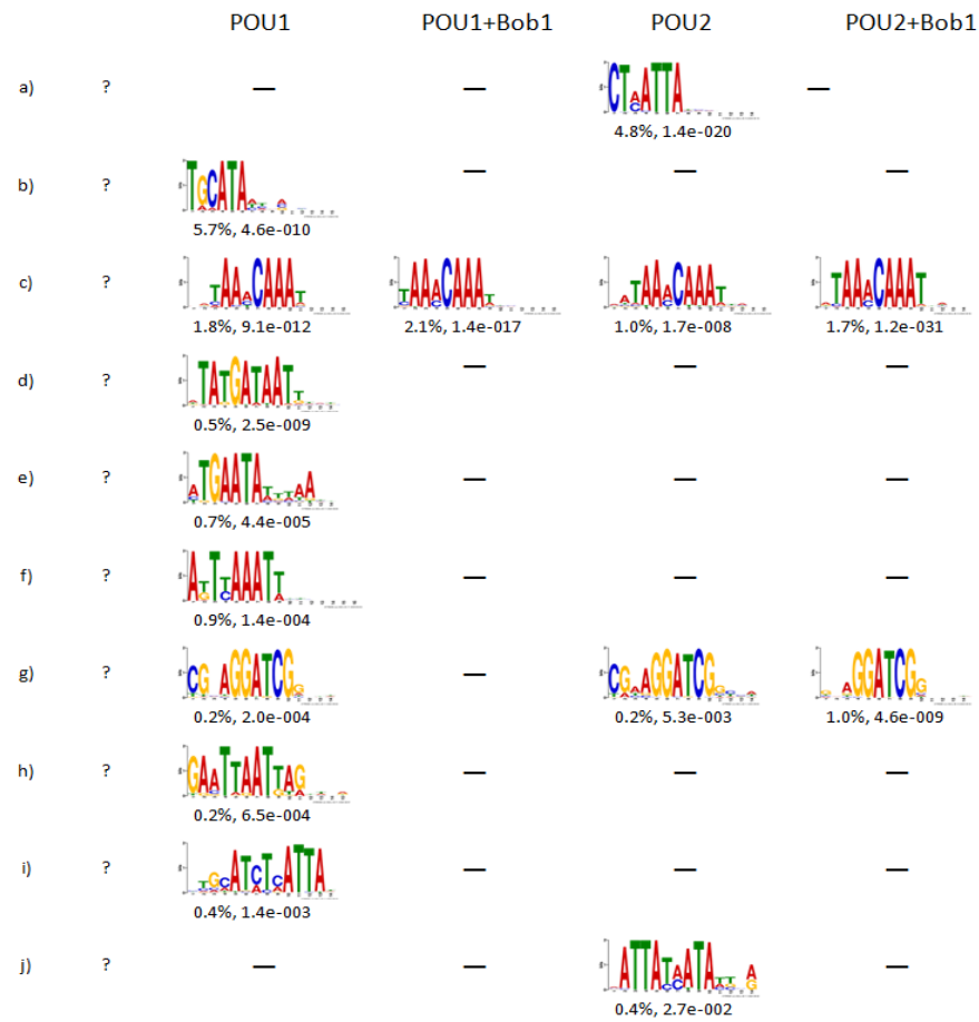
Figure S3. Minor motifs, identified by the STREME online tool, that exhibited p -values < 0.05 and could not be matched to any known POU-domain-binding motifs.